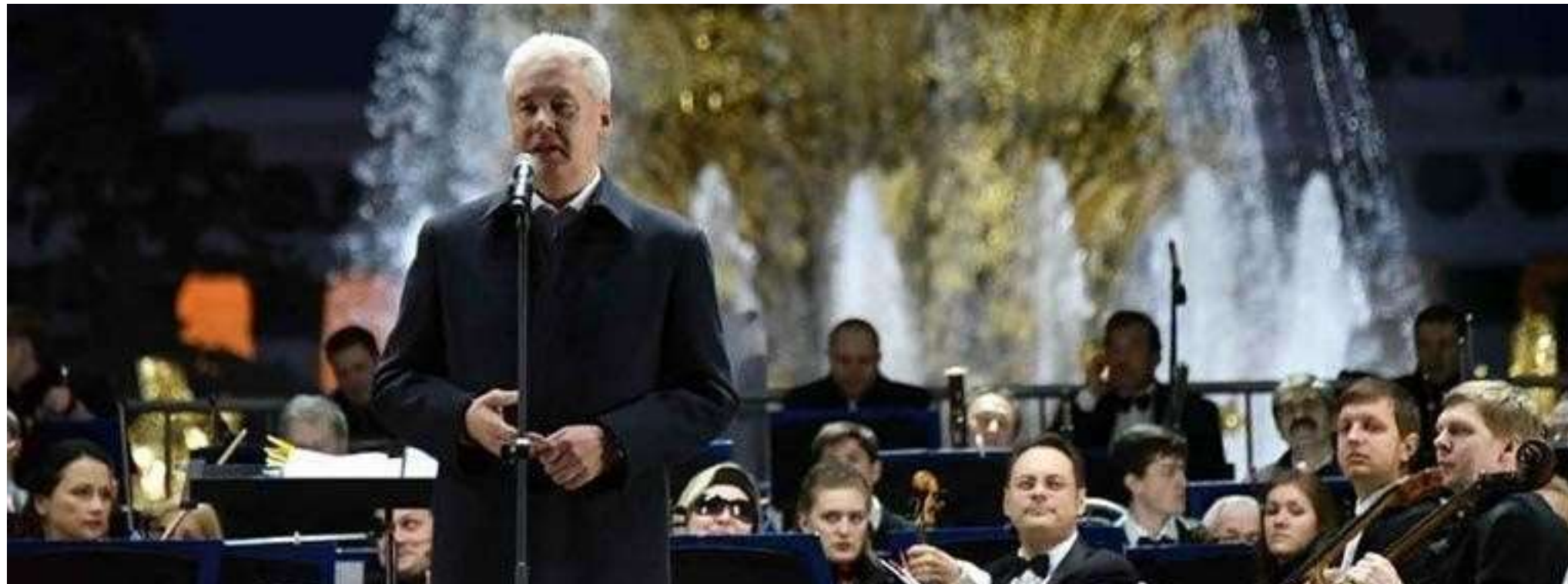
Mayor of Moscow Sergey Sobyenin

Moscow City Symphony — Russian Philharmonic takes part in the most significant official public events: celebration of the 70th Anniversary of the Victory in Great Patriotic War on Red Square, Poklonnaya Hill, Belorussky Railway Station; The Day of the City; Annual reception of the President of the Russian Federation on occasion of New Year celebration at the Kremlin.