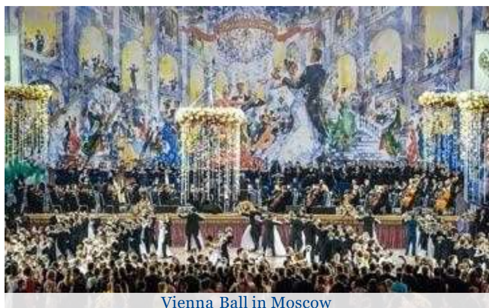
Vienna Ball in Moscow