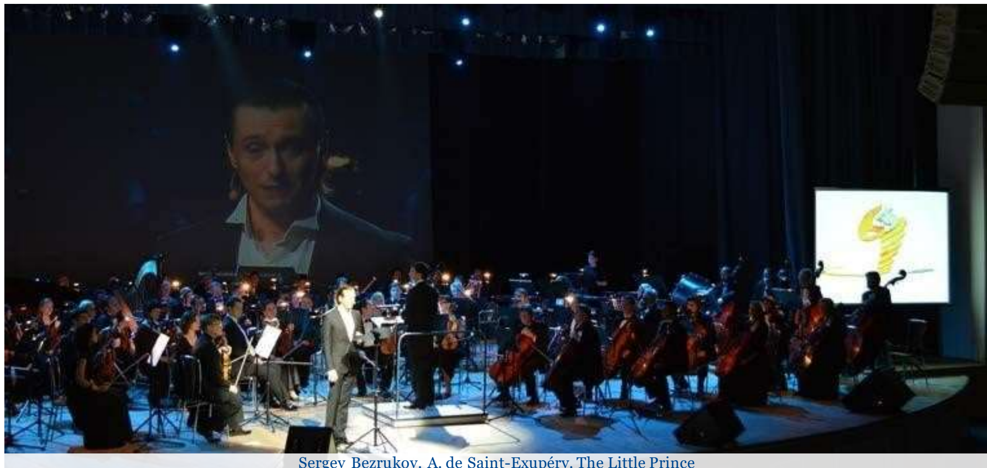
Sergey Bezrukov. A. de Saint-Exupéry. The Little Prince

With the help of the modern light projection equipment the orchestra presented special project for children, "Fairy Tale in Russian Music", which included, The Tale of Tsar Saltan, The Golden Cockerel and The Little Humpbacked Horse. All mentioned above projects performed with participation of famous theatre and TV actors.