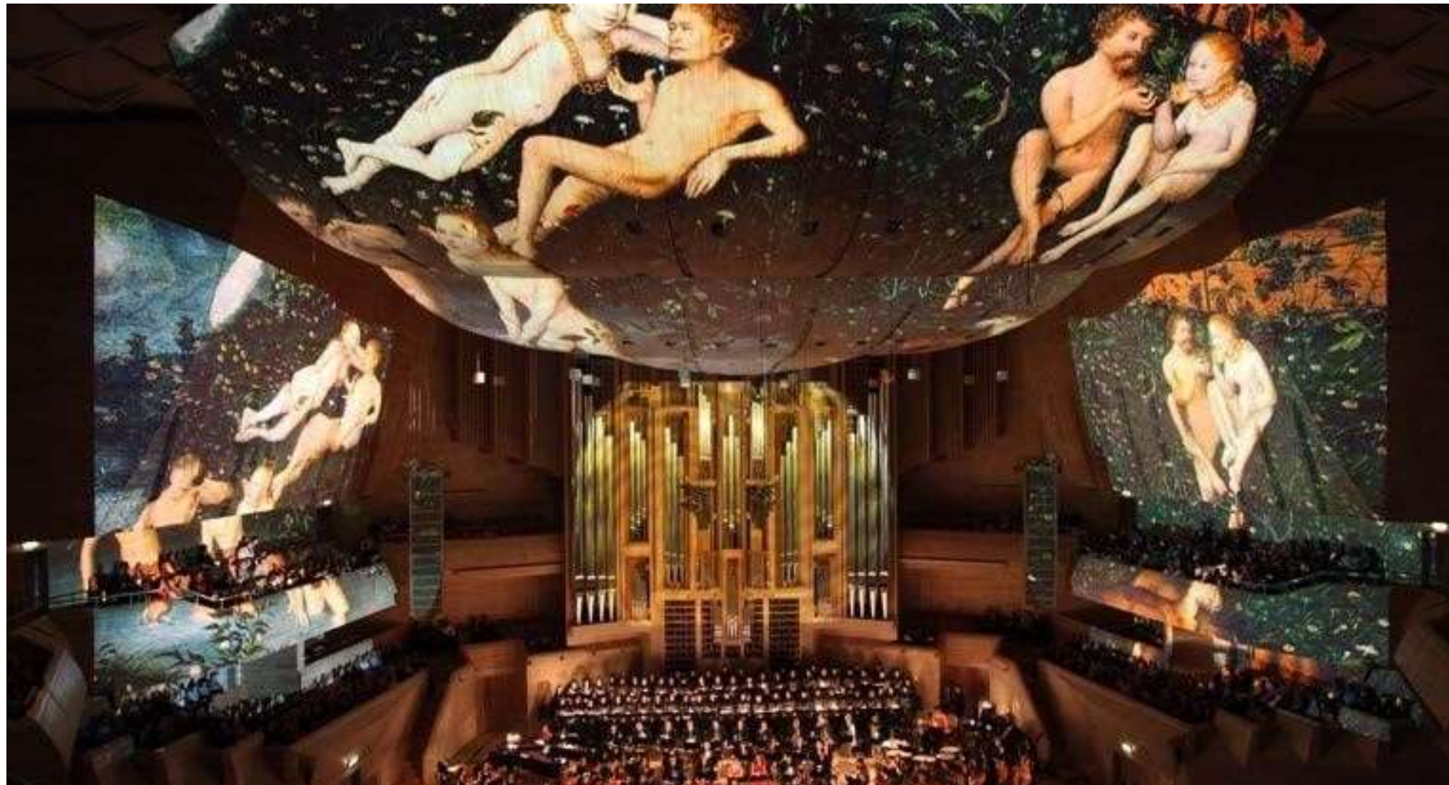
C. Orff. Carmina Burana

Confirming the status of the orchestra of new millennium, Moscow City Symphony – Russian Philharmonic one of the first began to implement large-scaled innovative multimedia projects. Legendary cantata "Carmina Burana" by Carl Orff with large-scaled video projections of Botticelli, Michelangelo, Raphael, Bosch, Bruegel, and Durer's masterpieces is one of the most successful. These vivid visual images fulfill the whole space of the concert hall.