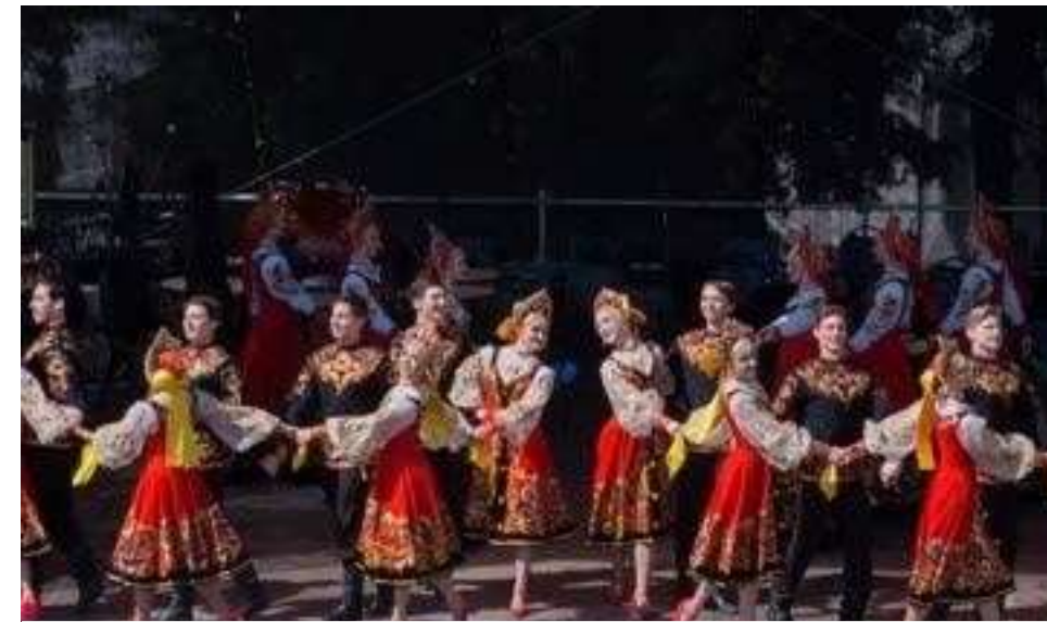
Gzhel Dance Theatre