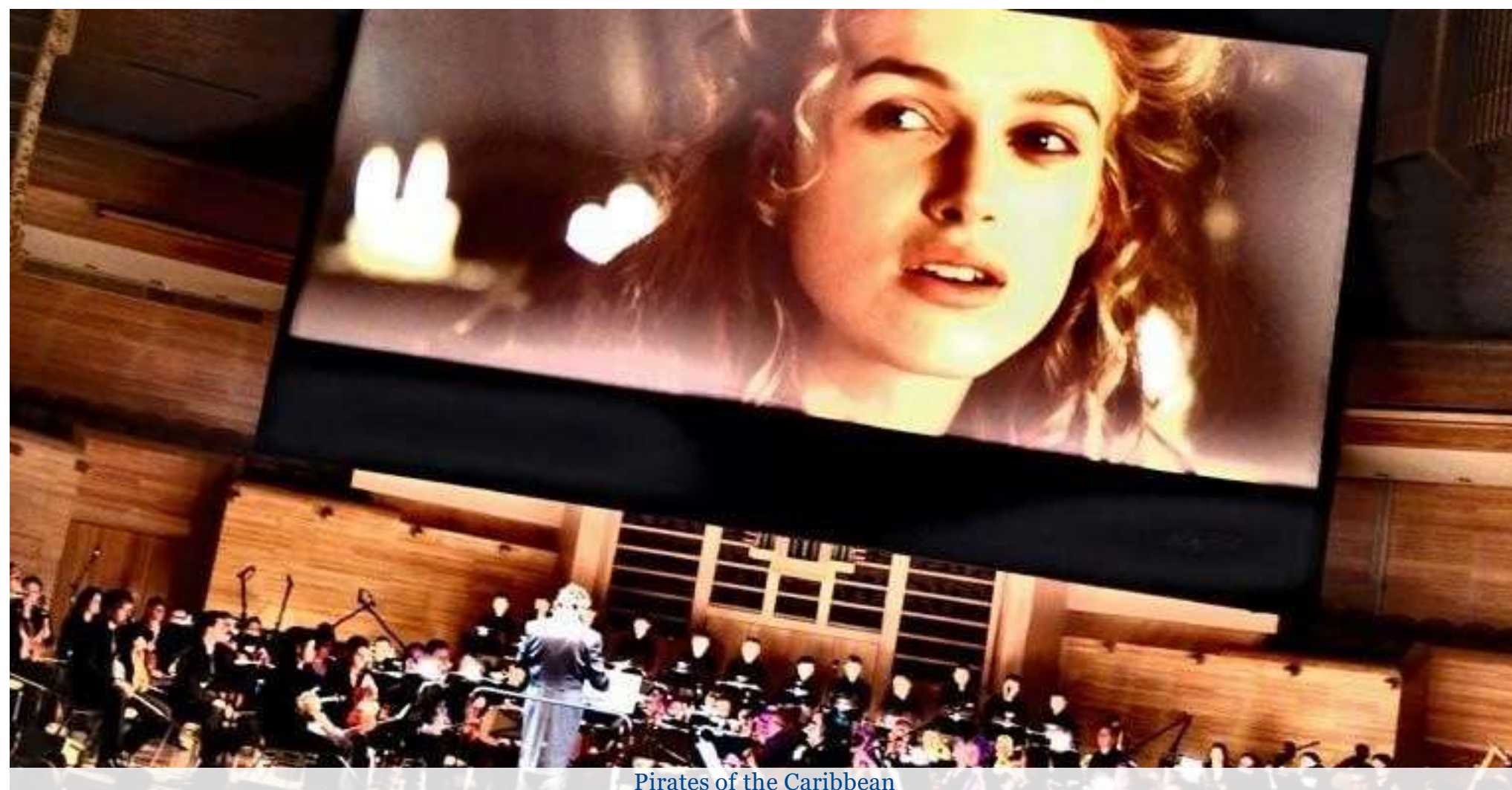
Pirates of the Caribbean

In order to attract new audience to "live" music projects the orchestra organized and performed at several Live Cinema Concerts, such as Metropolis, Gladiator, Pirates of the Caribbean, The Godfather, The Lord of the Rings.