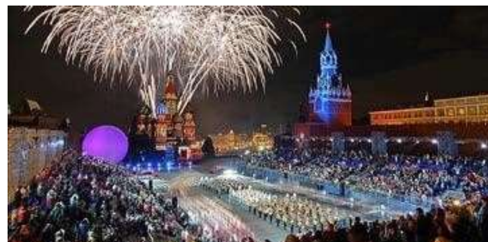
70th Anniversary of the Great Victory on Red Square