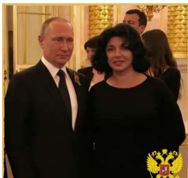
With Russian President Vladimir Putin