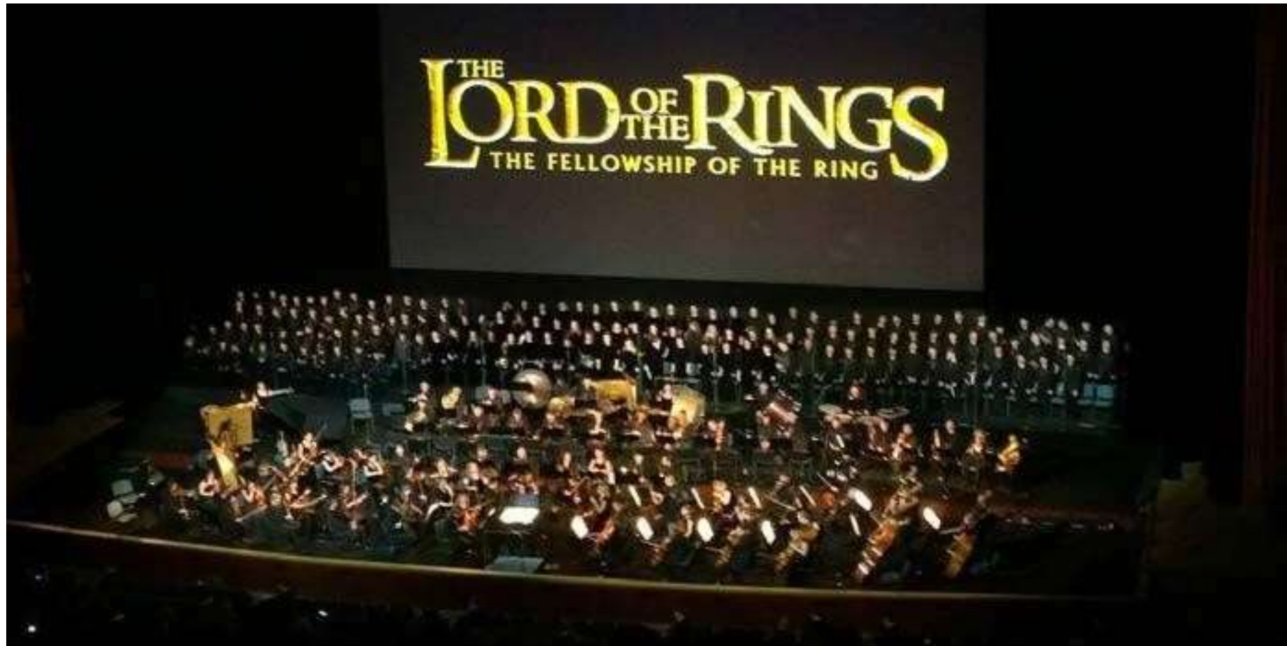
The Lord of the Rings