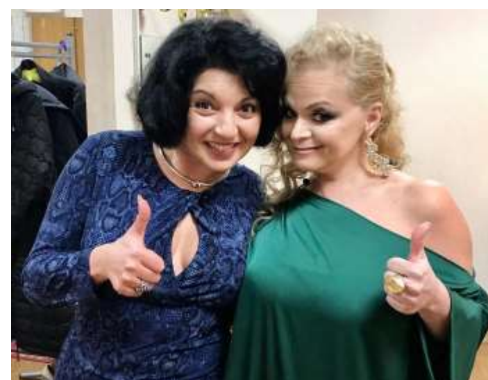
With Larisa Dolina