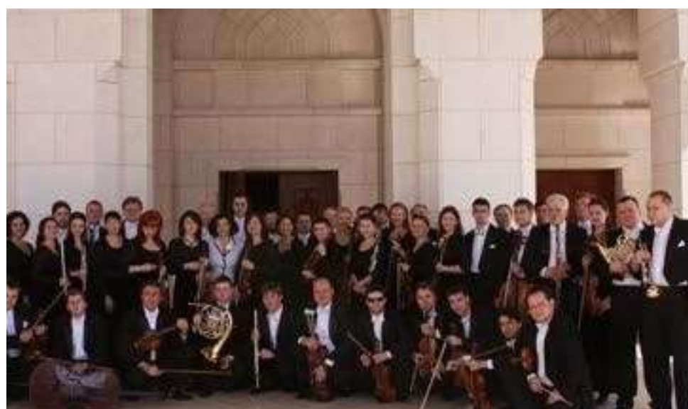
Royal Opera House Muscat, Oman