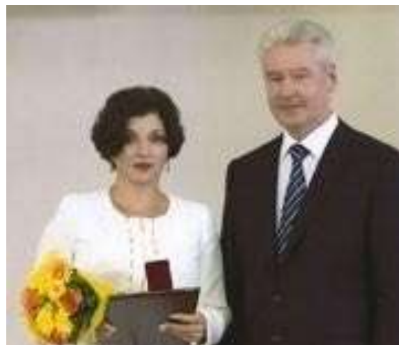
With Mayor of Moscow Sergey Sobyenin