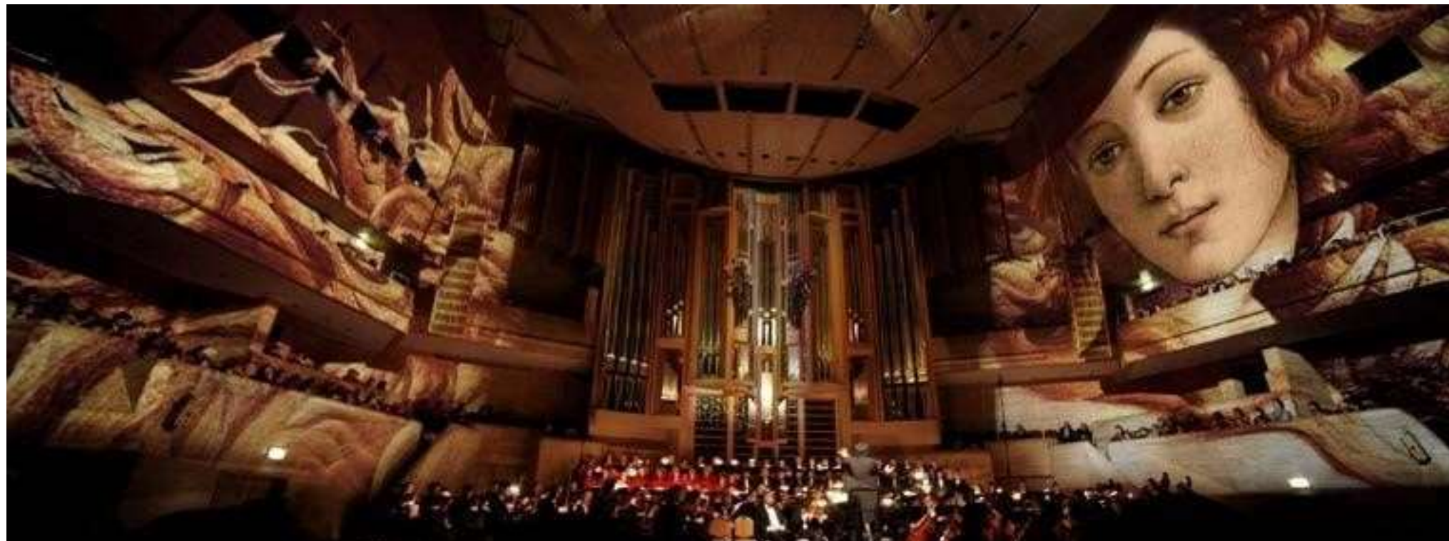
C. Orff. Carmina Burana

Confirming the status of the orchestra of new millennium, Moscow City Symphony – Russian Philharmonic one of the first began to implement large-scaled innovative multimedia projects. Legendary cantata "Carmina Burana" by Carl Orff with large-scaled video projections of Botticelli, Michelangelo, Raphael, Bosch, Bruegel, and Durer's masterpieces is one of the most successful. These vivid visual images fulfill the whole space of the concert hall.