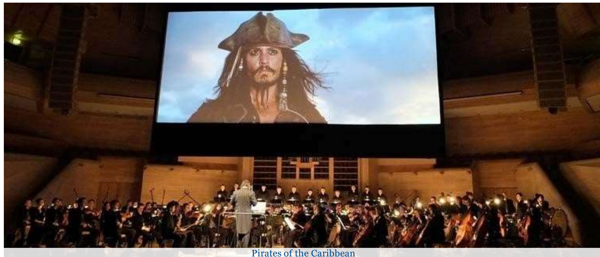
Pirates of the Caribbean

In order to attract new audience to "live" music projects the orchestra organized and performed at several Live Cinema Concerts, such as Metropolis, Gladiator, Pirates of the Caribbean, The Godfather, The Lord of the Rings.