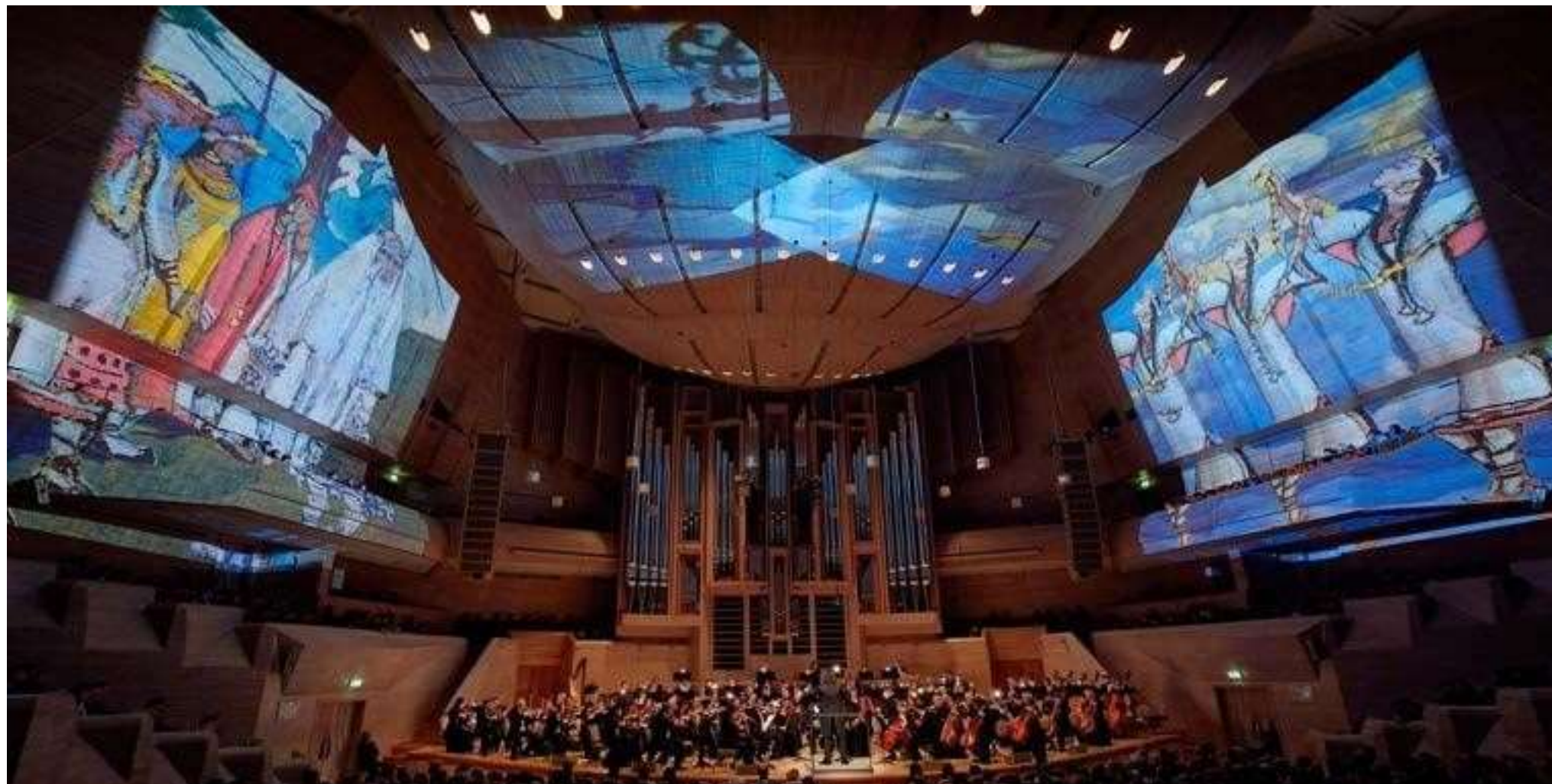
I. Stravinsky. The Rite of Spring

The orchestra held a Festival of four concerts, during it two new multimedia projects were shown: "Holy Spring" by Igor Stravinsky and "Scheherazade" by Nikolay Rimsky-Korsakov with restored sketches of Nikolay Roerich and Leon Bakst, created for famous Diaghilev's Ballets Russes in Paris at the beginning of the XX century.