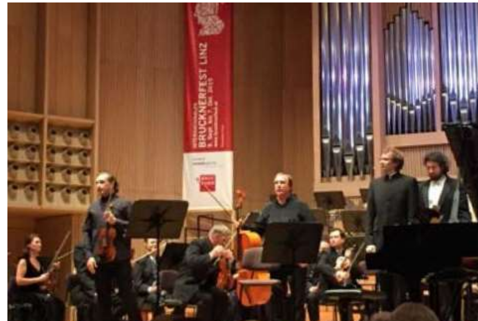
Brucknerfest, Linz, Austria