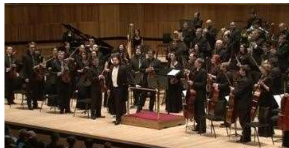
Royal Festival Hall, London, UK