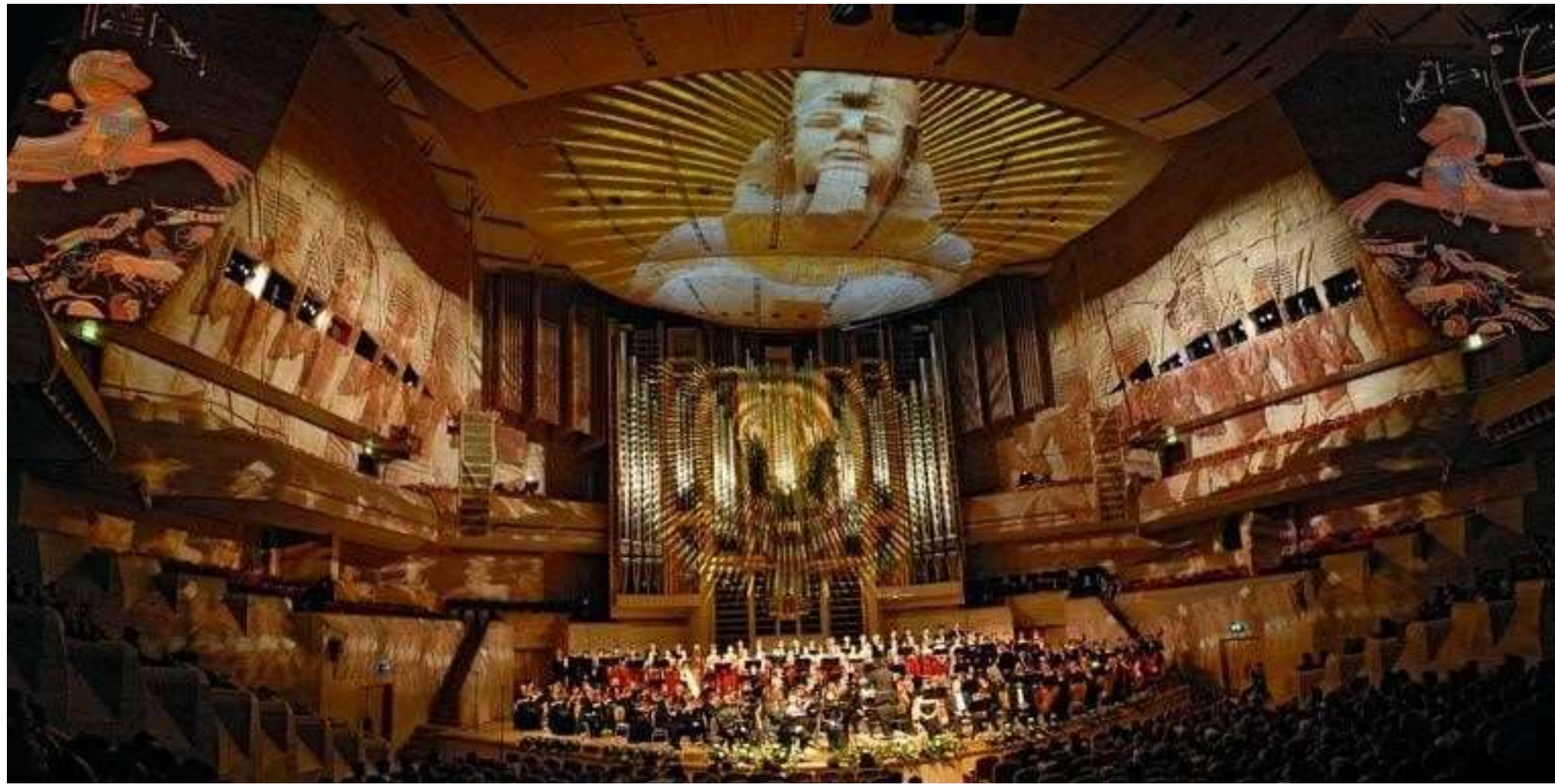
G. Verdi. Aida