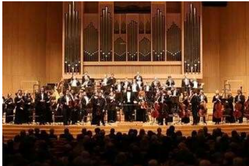
Brucknerfest, Linz, Austria