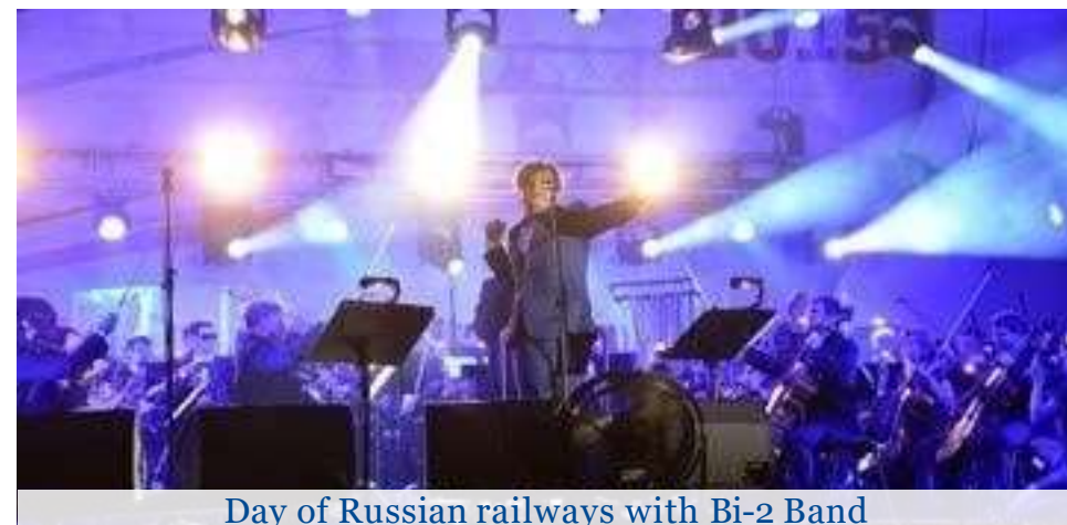
Day of Russian railways with Bi-2 Band

Moscow City Symphony — Russian Philharmonic participated in several projects of Russian Railways Company: in celebration of the 70th Anniversary of the Victory in Great Patriotic War — Letters of the Victory at Belorussky Railway Station, in celebration of the Day of Russian Railways Company with participation of Dmitry Hvorostovsky and Hibla Gerzmava, celebration of the Day of Russian railways with Bi-2 band in Samara, annual ceremony of presentation of Andrew the Apostle Award at State Kremlin Palace.