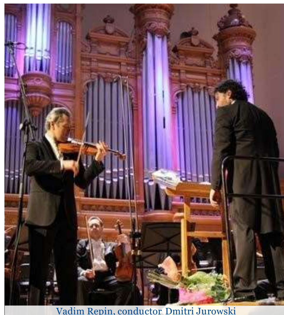
Vadim Repin, conductor Dmitri Jurowski