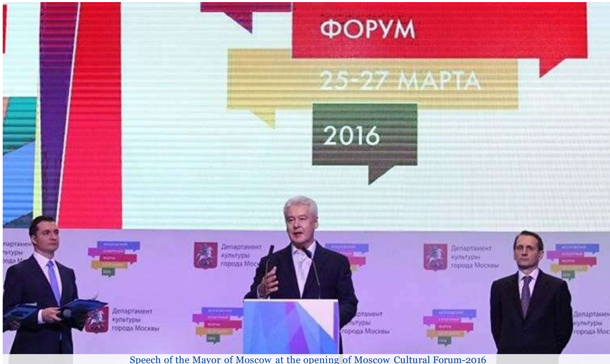
Speech of the Mayor of Moscow at the opening of Moscow Cultural Forum-2016

Moscow City Symphony — Russian Philharmonic participated in Moscow Cultural Forum-2016 at Moscow Manege.