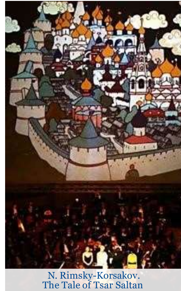
N. Rimsky-Korsakov. The Tale of Tsar Saltan

With the help of the modern light projection equipment the orchestra presented special project for children, "Fairy Tale in Russian Music", which included, The Tale of Tsar Saltan, The Golden Cockerel and The Little Humpbacked Horse. All mentioned above projects performed with participation of famous theatre and TV actors.