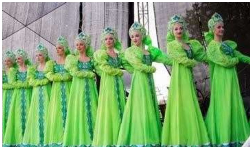
Gzhel Dance Theatre