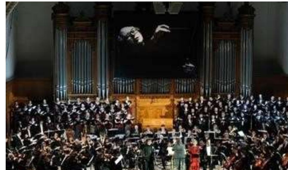
Mstislav Rostropovich International Festival