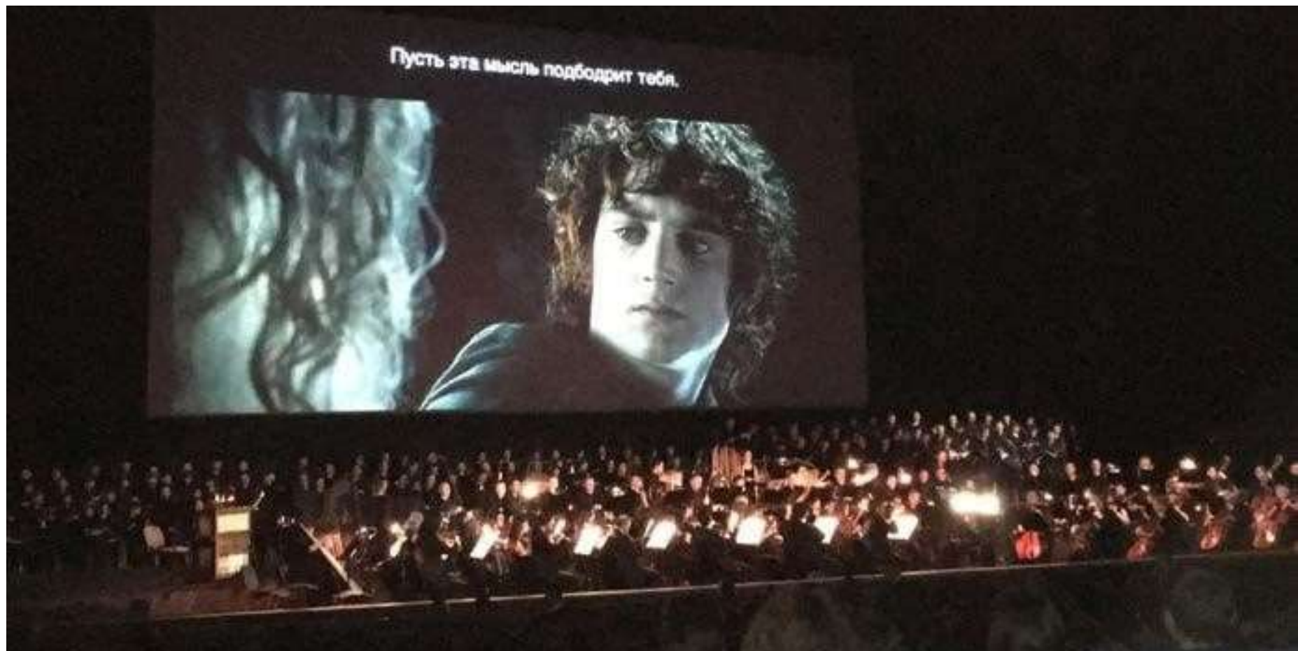
The Lord of the Rings