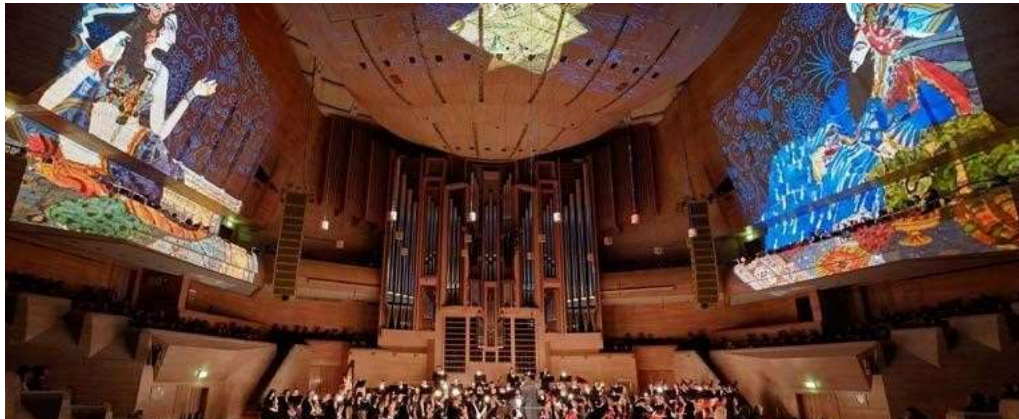
N. Rimsky-Korsakov. Scheherazade

The orchestra held a Festival of four concerts, during it two new multimedia projects were shown: "Holy Spring" by Igor Stravinsky and "Scheherazade" by Nikolay Rimsky-Korsakov with restored sketches of Nikolay Roerich and Leon Bakst, created for famous Diaghilev's Ballets Russes in Paris at the beginning of the XX century.