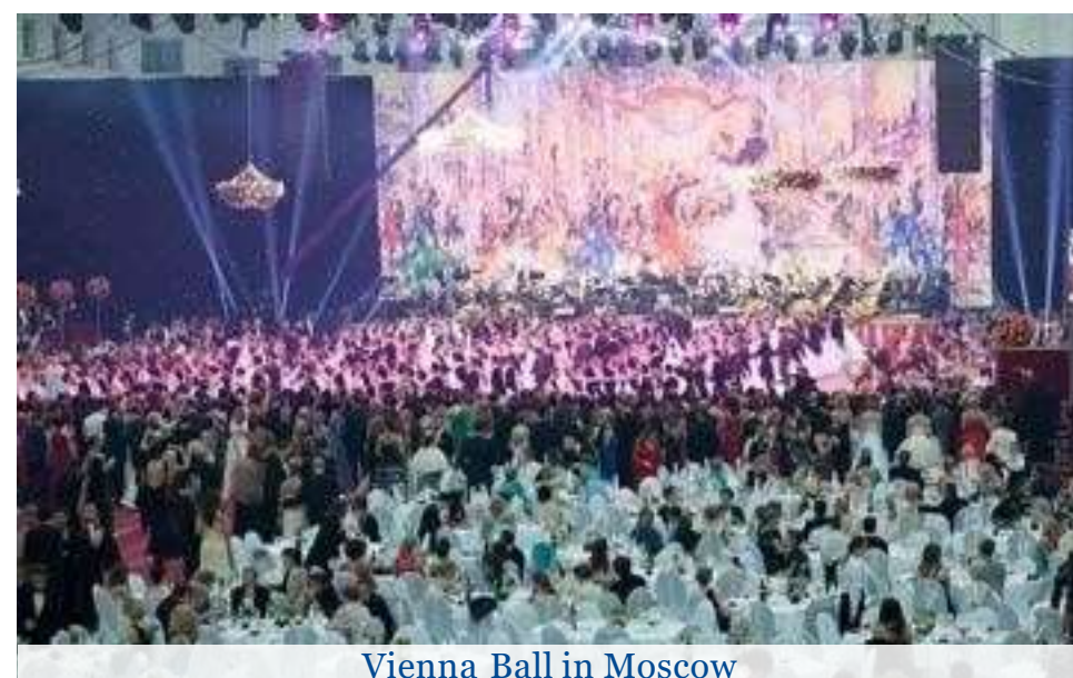
Vienna Ball in Moscow