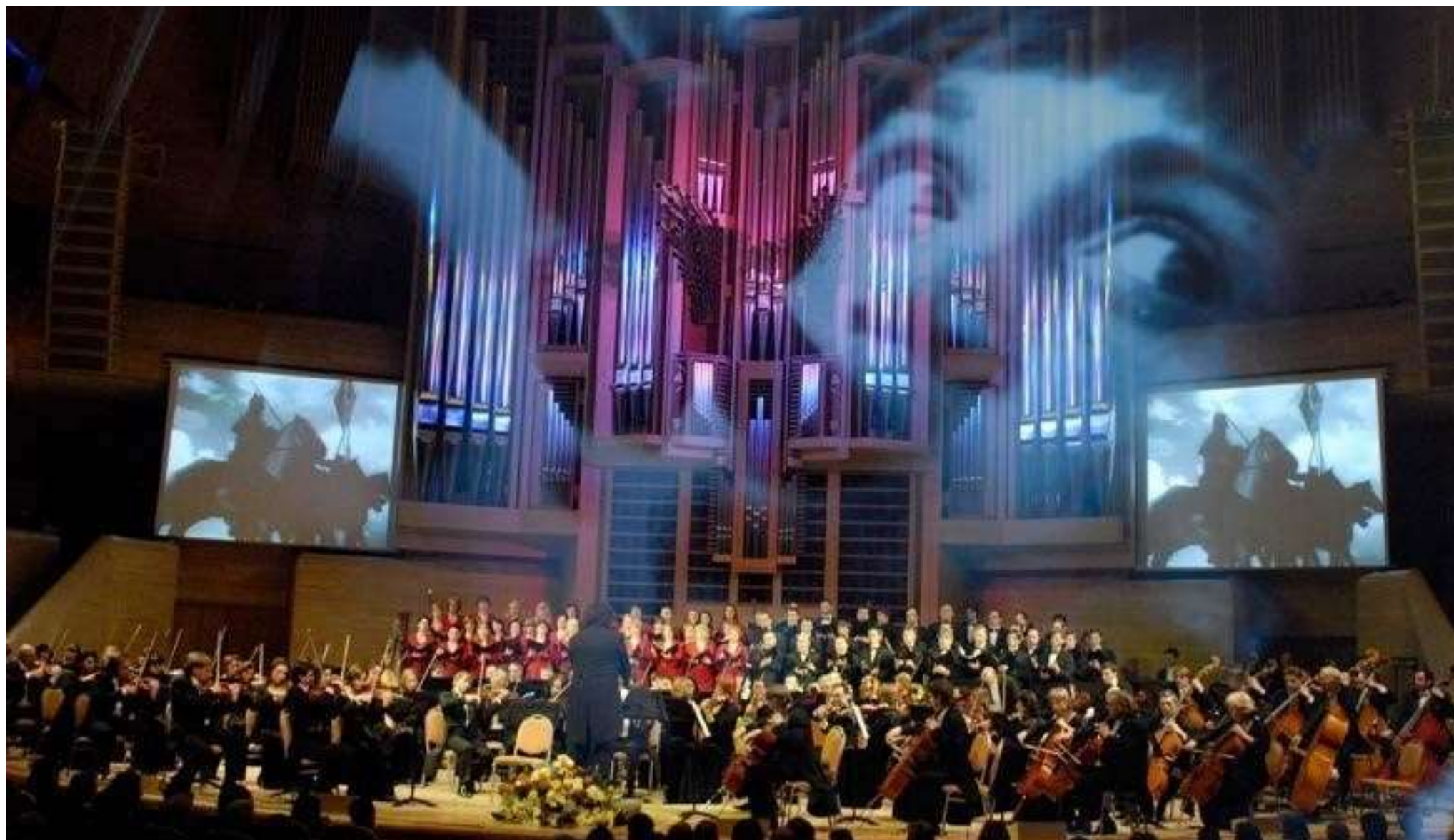
S. Prokofiev. Alexander Nevsky

The orchestra is not afraid of experiments, but never distorts the essence of compositions, putting excellent quality in the corner-stone of its art.