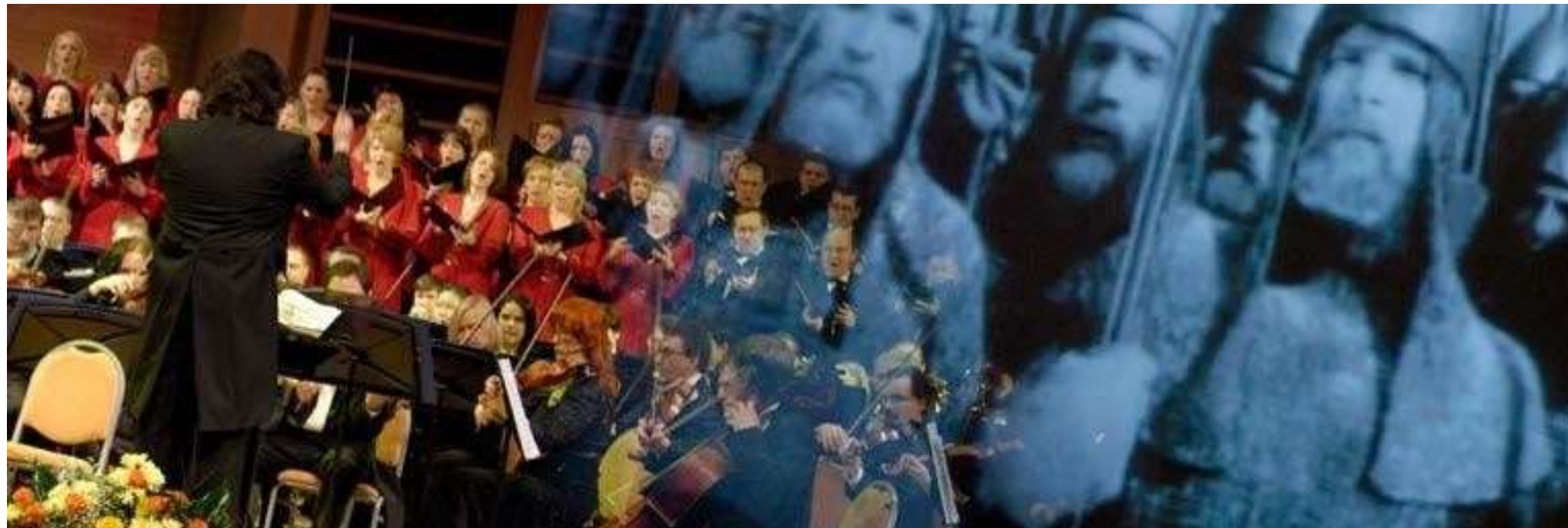
S. Prokofiev. Alexander Nevsky

The orchestra is not afraid of experiments, but never distorts the essence of compositions, putting excellent quality in the corner-stone of its art.