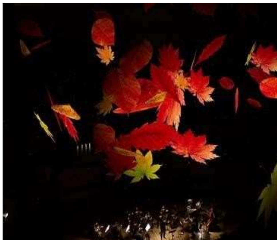
A. Vivaldi. The Four Seasons