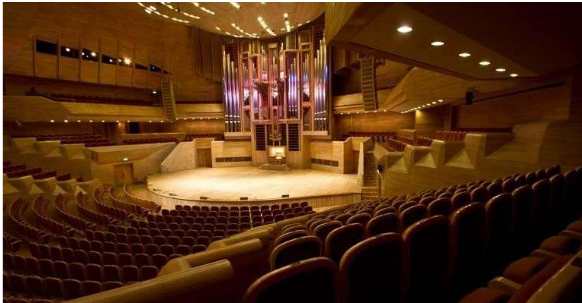
House of Music's Svetlanov Hall

Moscow International House of Music — modern centre of performing arts built in 2002 on the initiative of the Moscow City Government — is Moscow City Symphony — Russian Philharmonic's residence and its concert, rehearsal and administrative base.