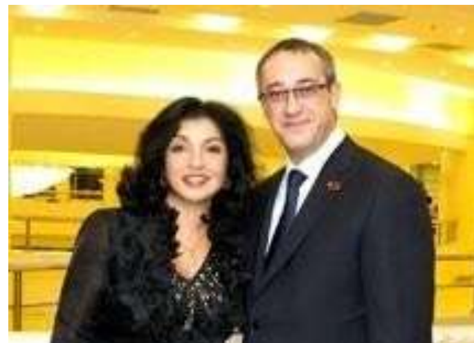
With Moscow City Duma Chairman Alexey Shaposhnikov