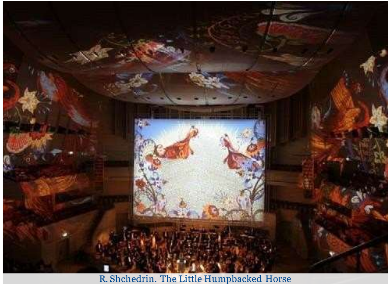
R. Shchedrin. The Little Humpbacked Horse