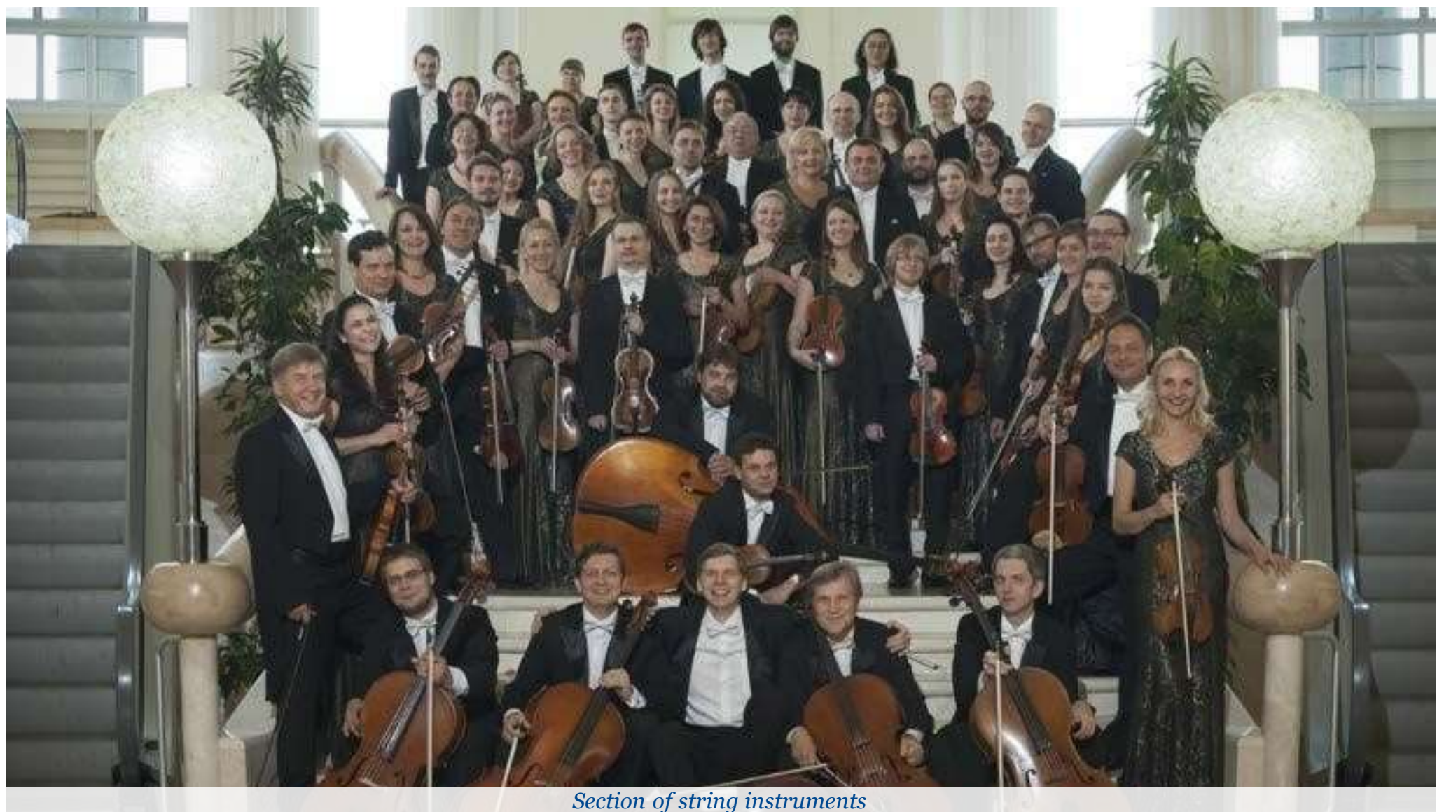
Section of string instruments