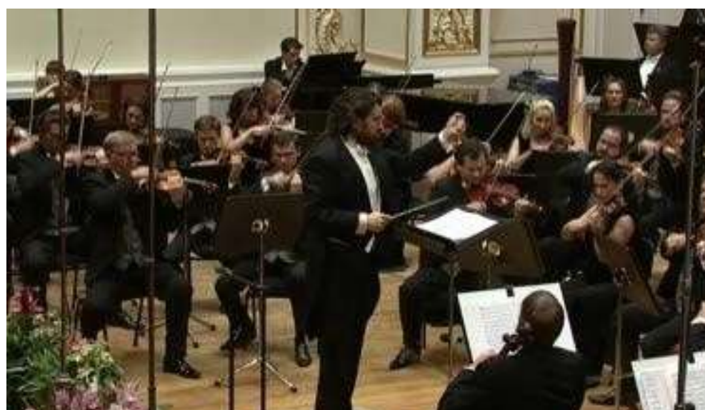
International Music Festival, Bratislava, Slovakia