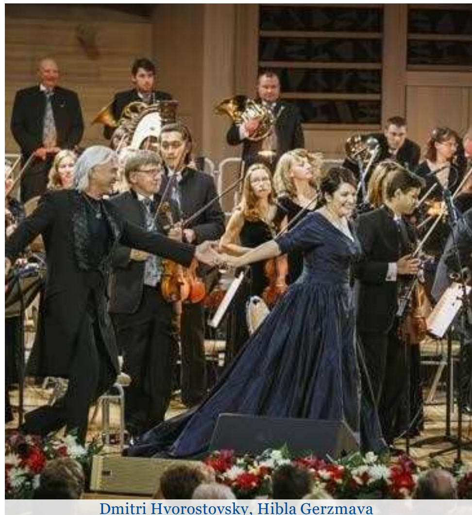
Dmitri Hvorostovsky, Hibla Gerzmava