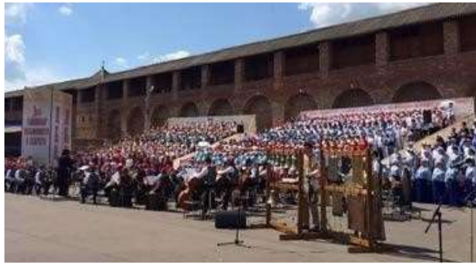
Day of Slavic Writing and Culture, Kolomna

Moscow City Symphony – Russian Philharmonic released a CD –"Time of Great Music" with compositions from Russian classical music with the support of the United Russia Party.