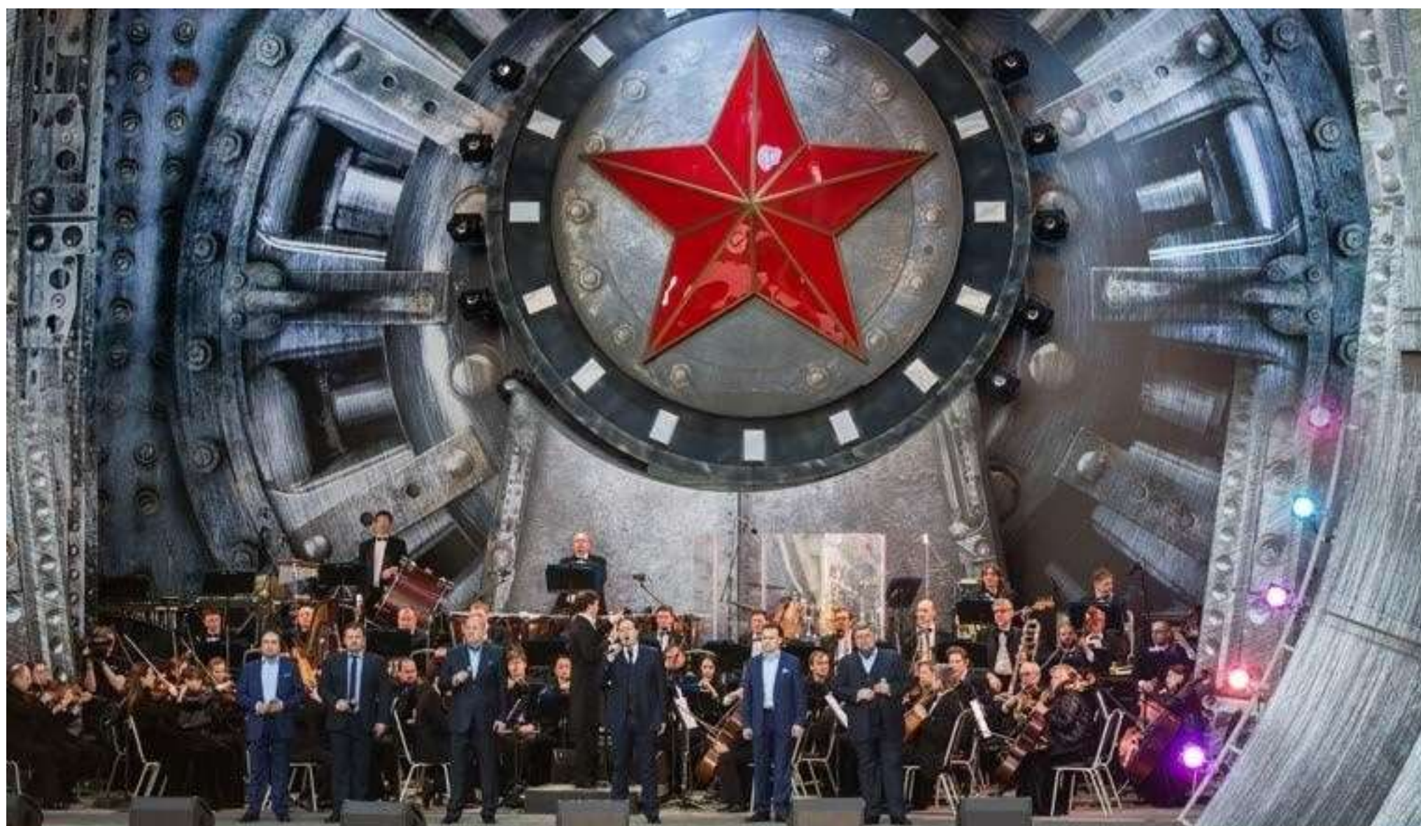
70th Anniversary of the Great Victory at Belorussky Railway Station

For active participation in preparation and holding events connected with the 70th Anniversary of the Victory in the Great Patriotic War Moscow City Symphony — Russian Philharmonic was awarded with a letter of acknowledgement from Sergey Ivanov, the Chief of Staff of the Presidential Executive Office.