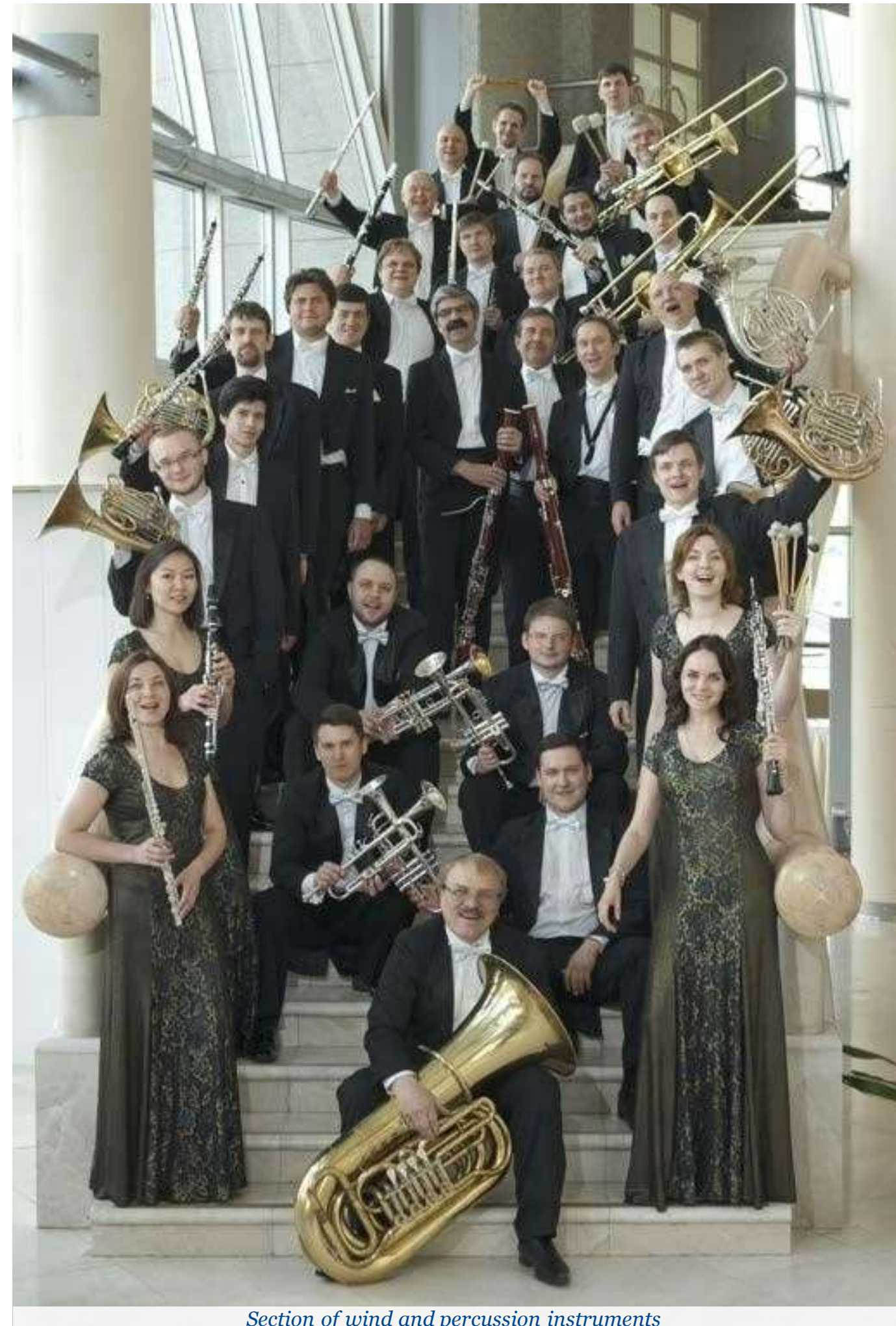
Section of wind and percussion instruments

Moscow City Symphony "Russian Philharmonic" is the only one official orchestra of the Moscow government. It is unique multi-genre orchestra, which performs music of various styles, from classical to rock at the highest professional level. Today it is one of the best and one of the most popular orchestras in Russia, which has deservedly won the love of Muscovites, Russians and has become known, as the world- class brand. Critics note strong energy of the concerts, which does not leave anyone uninterested.