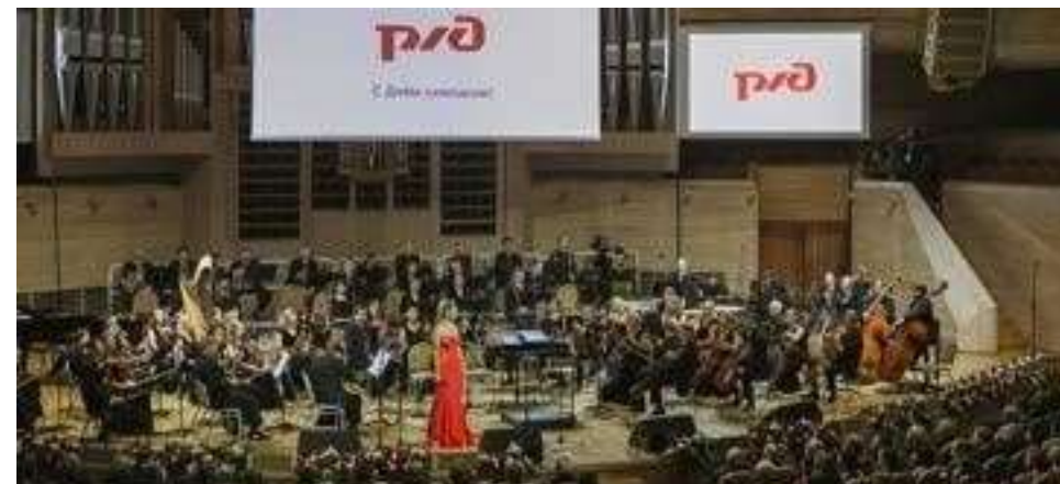
Day of Russian Railways Company