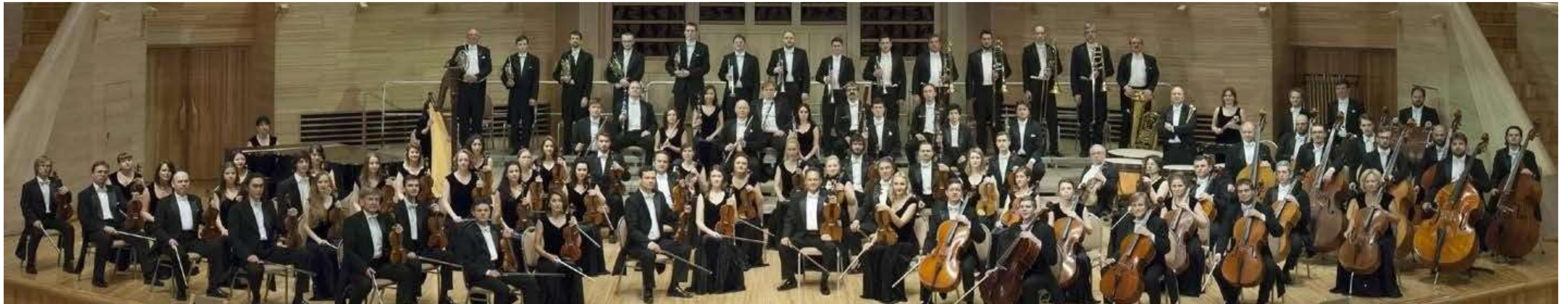
Moscow City Symphony — Russian Philharmonic