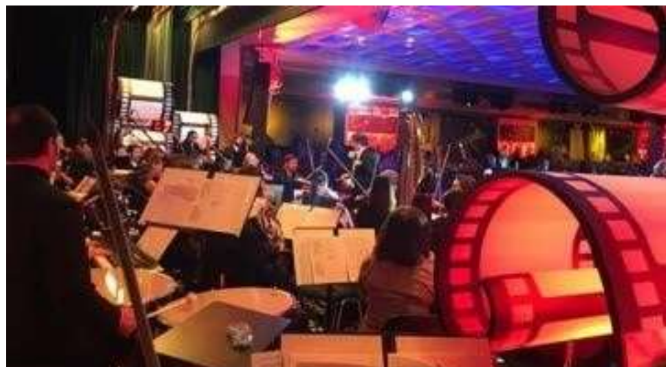
Reception of the President at the Kremlin