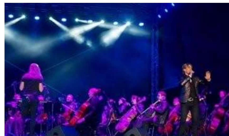
Queen & ABBA Symphony