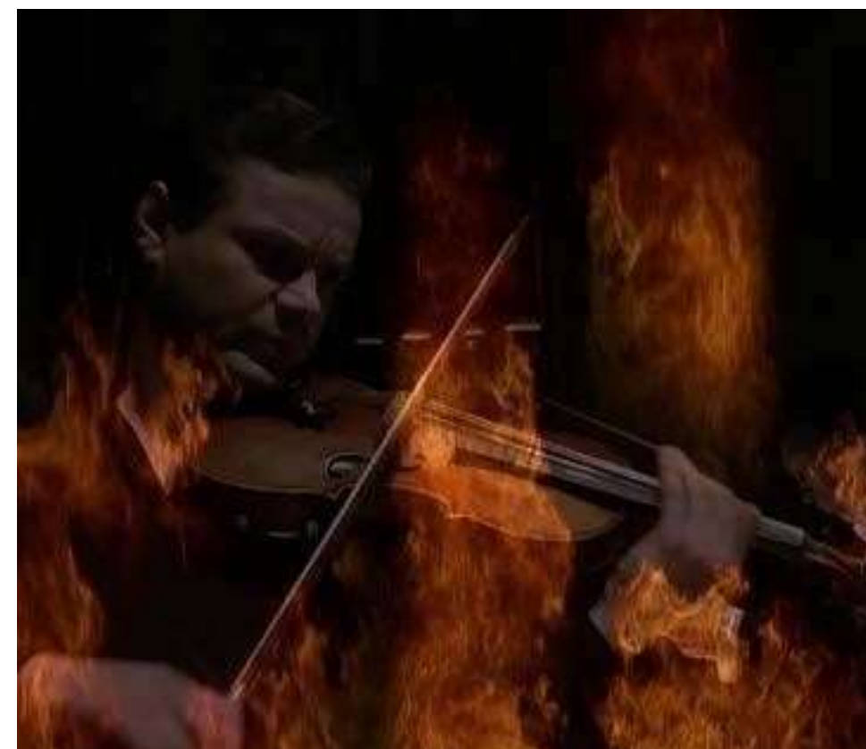
A. Piazzolla. The Four Seasons of Buenos-Aires