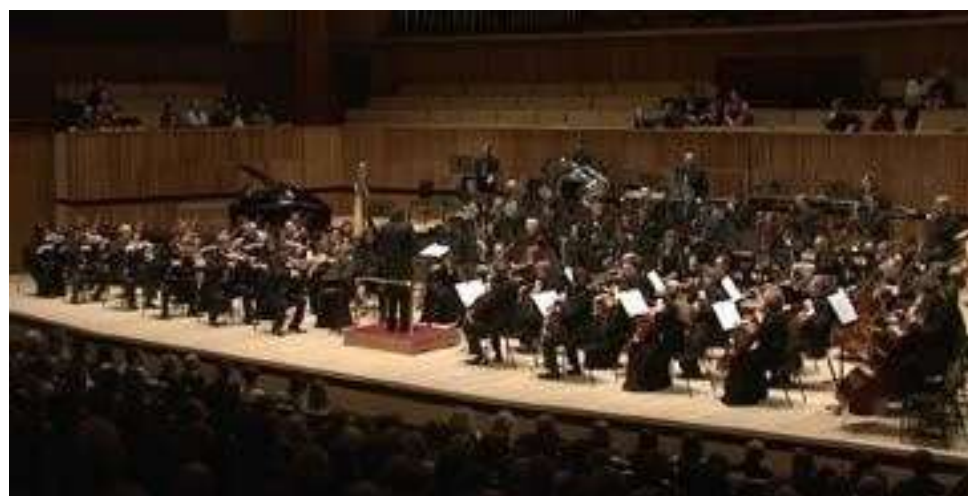
Royal Festival Hall, London, UK