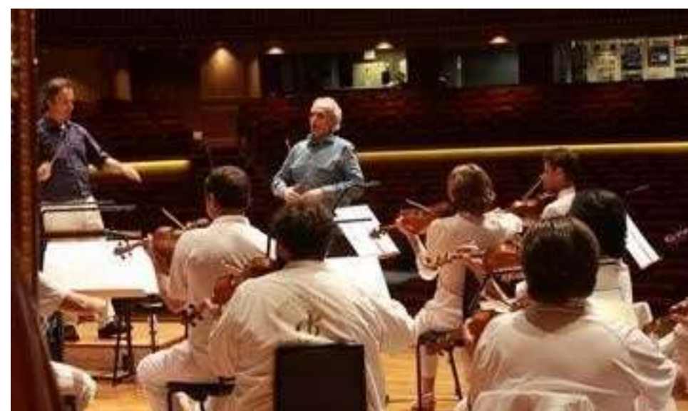
With José Carreras, Oman