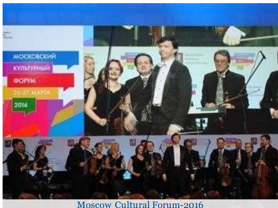
Moscow Cultural Forum-2016

Moscow City Symphony — Russian Philharmonic participated in Moscow Cultural Forum-2016 at Moscow Manege.