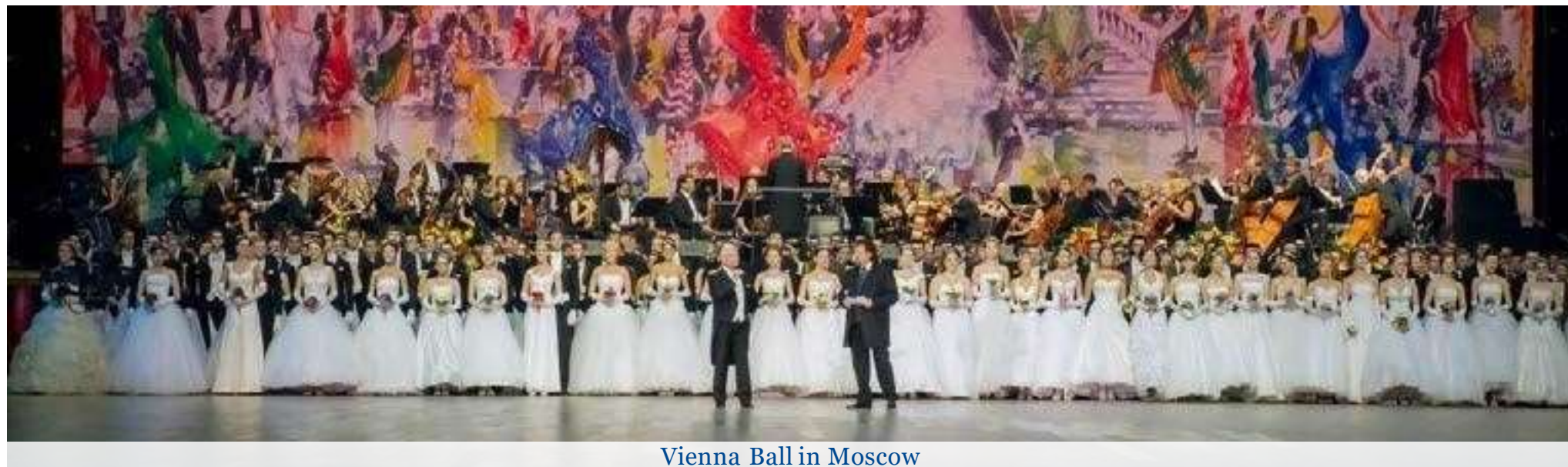
Vienna Ball in Moscow

Russian Philharmonic annually opens Charity Vienna Balls in Moscow held under the patronage of Moscow City Government, the Magistrate of Vienna, and the Embassy of Austria in Russia.