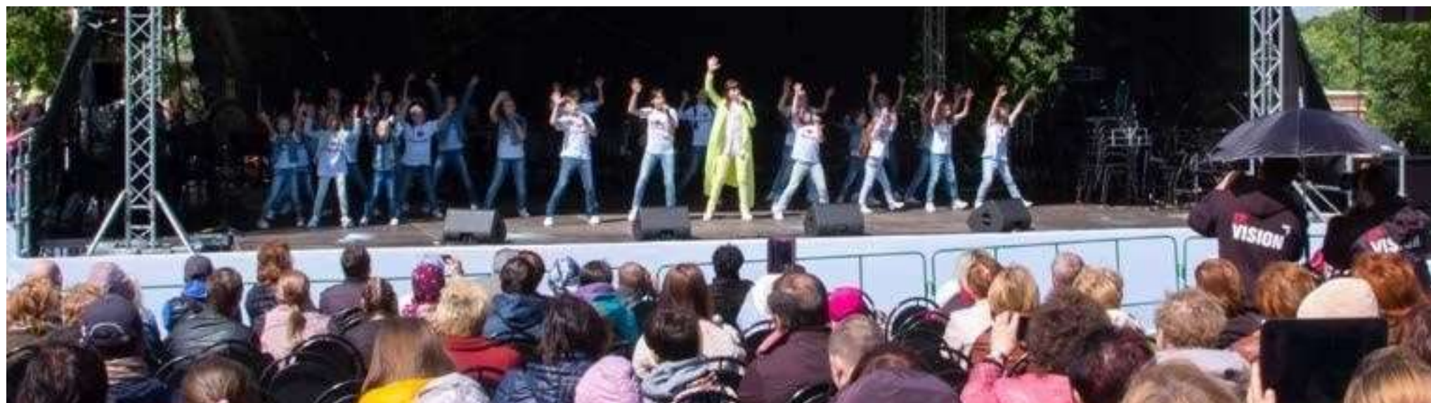
Children's music group Neposedy