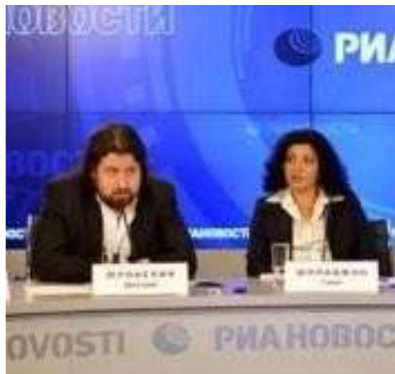
With Dmitri Jurowski