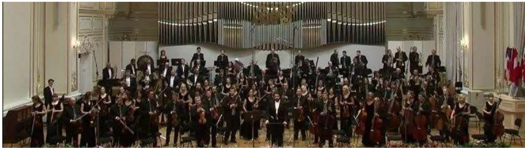
International Music Festival, Bratislava, Slovakia