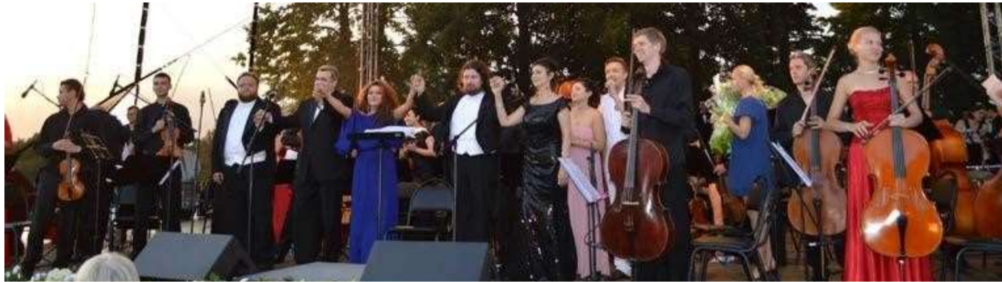
Soloists of the Bolshoi Theatre of Russia, conductor Dmitri Jurowski

Moscow City Symphony — Russian Philharmonic opened the III Mstislav Rostropovich International Festival at Grand Hall of Moscow Conservatory with the performance of famous Shostakovich's opera — "Lady Macbeth of the Mtsensk District".