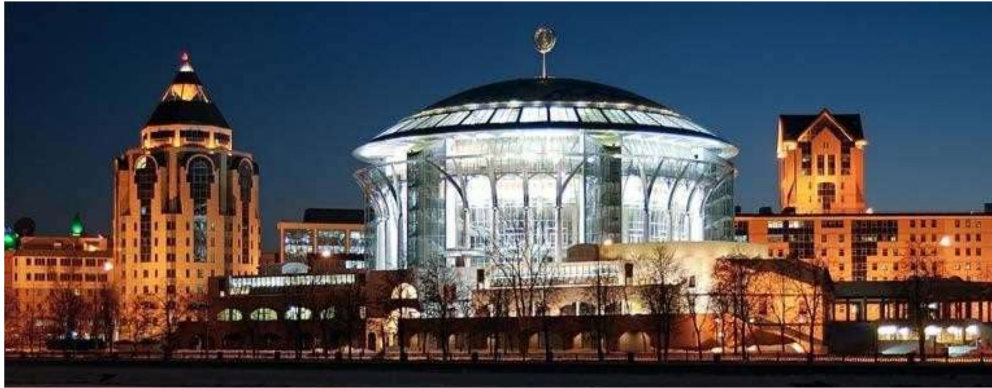
Moscow International House of Music

Moscow International House of Music — modern centre of performing arts built in 2002 on the initiative of the Moscow City Government — is Moscow City Symphony — Russian Philharmonic's residence and its concert, rehearsal and administrative base.