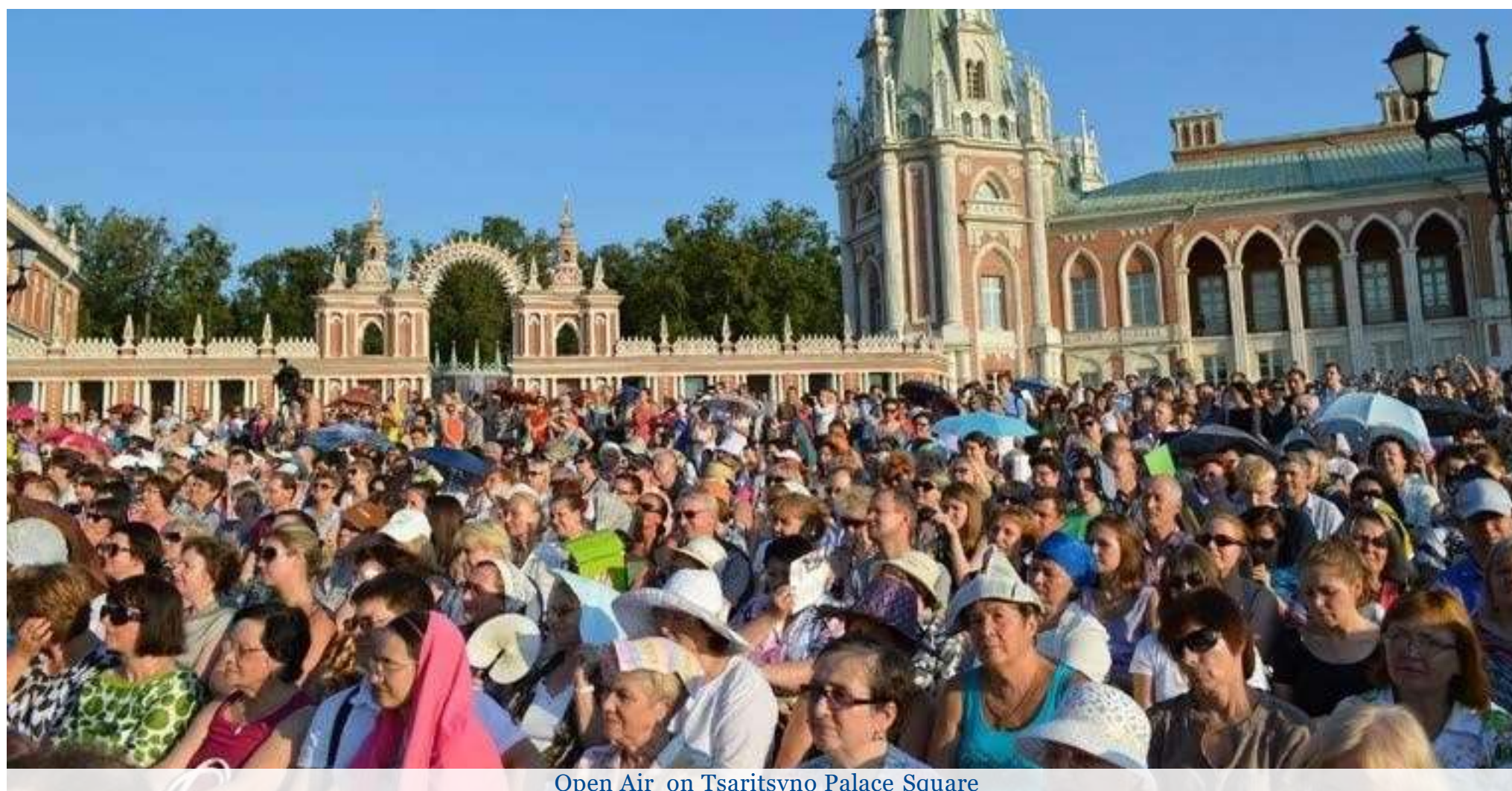
Open Air on Tsaritsyno Palace Square

Culmination of the Festival is a gala-concert on the Palace Square. According to the Moscow City Department of Culture festival is attended by min. 50 000 guests. Open air and a free entrance help to make classical music more popular within all categories of the audience. At the end of December the orchestra holds Moscow Classical Music Festival "Christmas-Fest" at Moscow International House of Music, which is annually attended by more than 15000 guests.