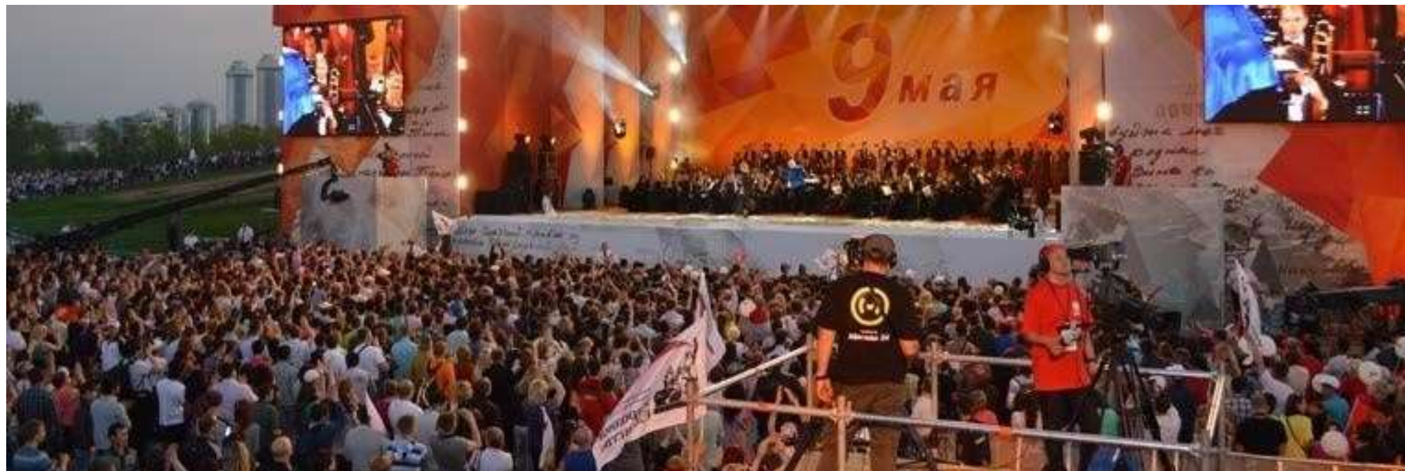
Victory Day at the Poklonnaya Hill

For active participation in preparation and holding events connected with the 70th Anniversary of the Victory in the Great Patriotic War Moscow City Symphony — Russian Philharmonic was awarded with a letter of acknowledgement from Sergey Ivanov, the Chief of Staff of the Presidential Executive Office.